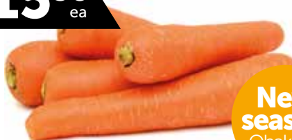
JUMBO CARROTS 10KG Code: 1047164