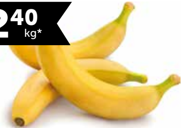
BANANAS Code: 1166182