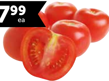
TOMATOES 2.5KG Code: 1045715