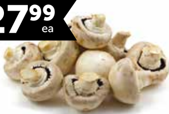
MARKET MIX MUSHROOMS 3KG Code: 1045844