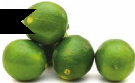
LIMES Code: 1166207