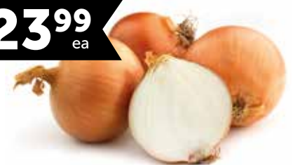
JUMBO ONIONS 20KG Code: 5239355

Prices valid Monday 23 March to Sunday 29 March 2020. All prices exclude GST. *Variable weight applies