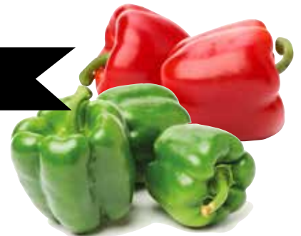
CAPSICUMS Code: 1166132 Green, 1360721 Red