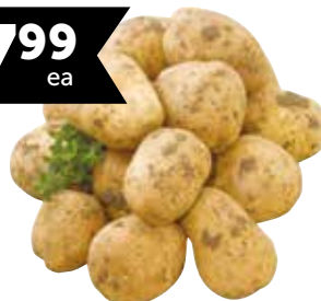
AGRIA POTATOES 10KG Code: 1045724